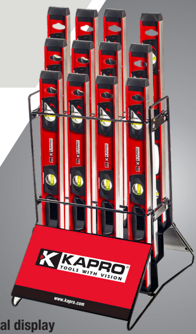
12 Piece metal display