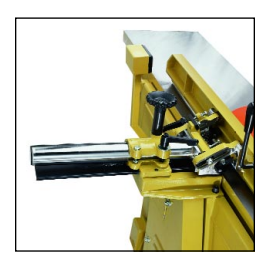
Large center-mounted fence with rack and pinion adjustment and ram lock. Positive stops for 90 and 45 degrees in and out.