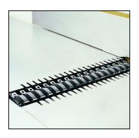
Solid Steel Helical Insert Head with 14 mm two-sided knives, no adjustment required after changing knives. Reduced sound levels when cutting.