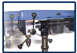
Head Moves Forward and Back