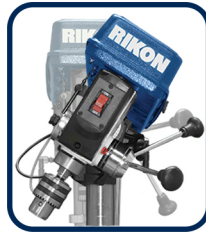
Head Tilts 45° Right and 90° Left