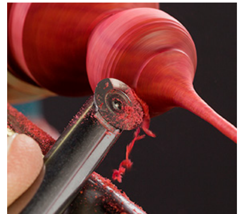
Shear-scraping alignment applies to both round & square Ultra-Shear Woodturning Tools.

The trick to the best finish from a shear-scrape is to pivot the woodturning tool rather than drag it. Keep the Woodturning Tool perpendicular to the point of cut. You'll know you're doing it right with the shavings come off as mere whisks and the surface of your turning looks and feels already polished.