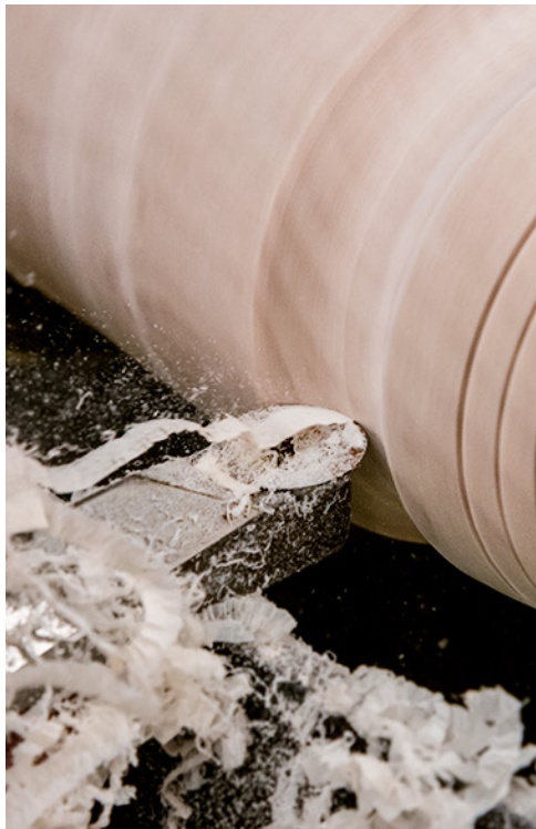
Full size woodturning tool shown in photo. Shaping technique applies to all round insert Ultra-Shear Woodturning Tools.

Ultra-Shear Round Insert woodturning tools create inside curves easily. Just pivot the woodturning tool around the arc you're trying to create. You can work uphill or downhill, though one will leave a better surface than the other. You can also plunge cut. Most cove cuts will be a combination of a plunge and pivot.